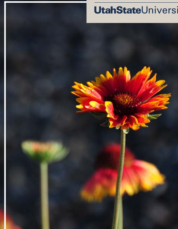
INDIAN BLANKET FLOWER ( Gaillardia spp.)