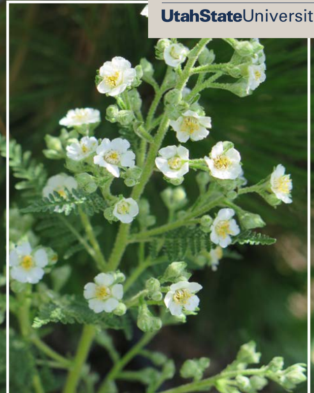
FERNBUSH ( Chamaebatiaria millefolium )