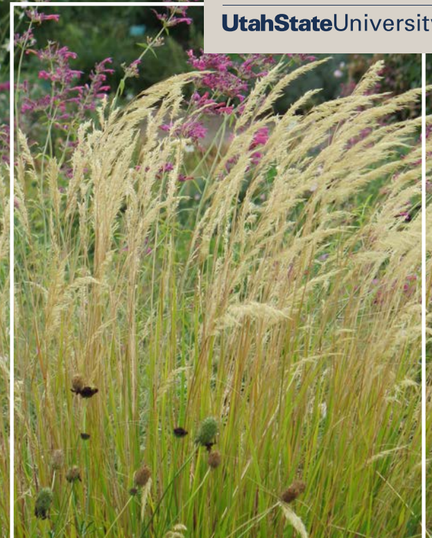
SILVER SPIKE GRASS ( Achnatherum calamagrostis )