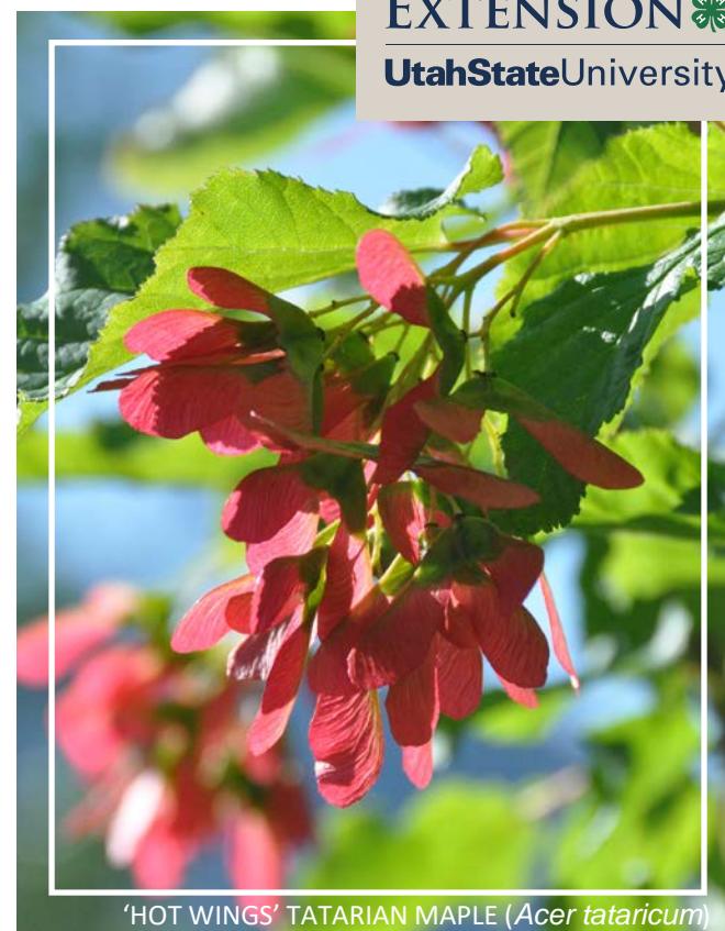
'HOT WINGS' TATARIAN MAPLE ( Acer tataricum )