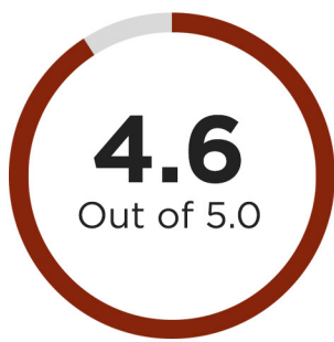
Vendor Approval Rating

Aerial photo of morning setup of the 200 vendor market. The market will be reorganized to accomodate up to 100 more businesses